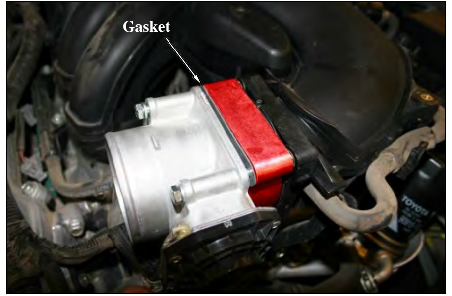
6. Slide the Poweraid Spacer (#1) and gasket (#2) between the intake manifold and the throttlebody. Make sure the "Flow" arrow on the spacer is pointing towards the intake manifold, and the gasket is next to the throttlebody. Install the 4 supplied 6mm x 75mm bolts (#3) and flat washers (#4) thru the throttlebody, gasket, spacer, into the intake manifold and tighten evenly to the vehicle manufacturer's specifications.