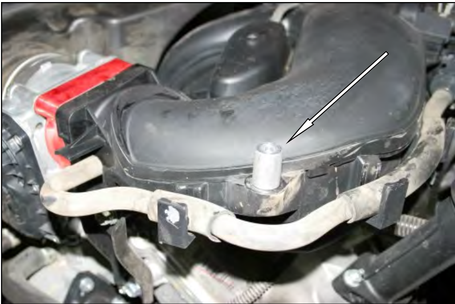
9. Install the 3/4" long round spacer (#11) on top of the threaded hole where the stud was removed on the intake manifold as shown and proceed to the next step.