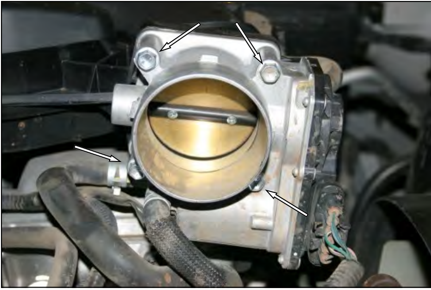
5. Using a 10mm socket, remove the 4 bolts that hold the throttlebody to the intake manifold.